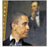
History book bound? President Obama has peered through a pecked business agenda.

WASHINGTON — Big problems. Big achievements. Big costs. Historians say President Obama's legislative record during a crisis-ridden presidency already puts him in a league with such consequential presidents as Lyndon Johnson and Franklin Roosevelt. But polls show voters aren't totally on board with his achievements, at least not yet, and the White House acknowledges that his victories have carried huge financial and political costs. "There are always costs in doing big things."