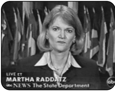
Martha Raddatz discounted Condoleezza Rice's report

In September, World News Tonight's Iraq stories used 60 sound bites from different sources and almost two-thirds were anti-war statements. But it's actually even worse. Of the 24 sound bites advocating a tough line on Iraq, 17 came from Bush administration officials, meaning ABC cited only seven sources from outside the administration who supported the war. Seven.