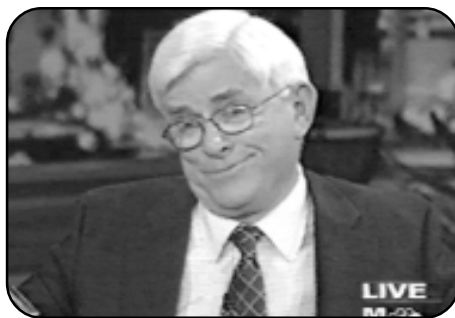
Donahue touts Hillary's old claim about a “vast right wing conspiracy.”

MSNBC's Phil Donahue just doesn't understand how anyone could doubt the