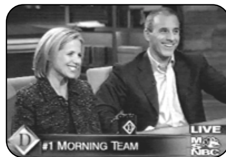
Couric and Lauer had a surprising answer to a question about media bias.

Just another fair, balanced, anti-business report from World News Tonight .