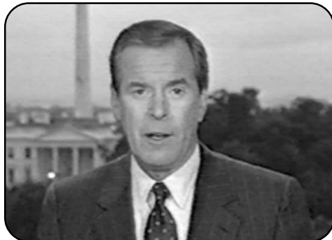
Peter Jennings and ABC News have waged an anti-war, anti-Bush campaign for the last six weeks.

ABC refused to report this link because it undermines their anti-Bush offensive. To prove the point in depth, MRC analysts conducted a thorough study of all 62 Iraq stories run by ABC's World News Tonight in September. The study found ABC's coverage not just terribly skewed, but actually far worse than the coverage of their liberal counterparts at NBC and CBS.