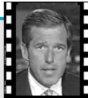
Brian Williams thinks “military swagger” helped cause 9-11

Hearst Newspapers Helen Thomas on Iraq: “Why is a family grudge included in the official paper that states our position on war and peace”...One more from Helen: “Are you going to kill all these people to get democracy?”... Newsweek 's Eleanor Clift is still defending Bill Clinton: “You can argue the Clinton administration didn't do enough [to fight terrorism] but they did a heck of a lot more than the Bush administration did in their first nine months in office”...NBC anchor-in-waiting Brian Williams belittles American “military swagger”: “Isn't that worldview part of what got the United States in trouble on September 11?”...Speaking of September 11, Walter Cronkite thinks “very definitely that foreign policy could have caused what has happened”...On the other hand, conservative columnist Cal Thomas on the rumored ABC and CNN merger: “What you would get if you crossed Peter Jennings and Judy Woodruff is a younger liberal”...Pro-life, Emmy Award winning actress and Everybody Loves Raymond co-star Patricia Heaton : “As a Christian it will not be Barbra Streisand I'm standing in front of when I have to make an accounting of my life.”