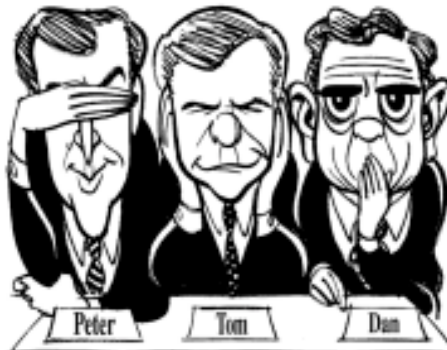
See no balance. Hear no balance. Speak no balance.

“See no balance” Blue Travel Koozie $9.95 / $7.95*