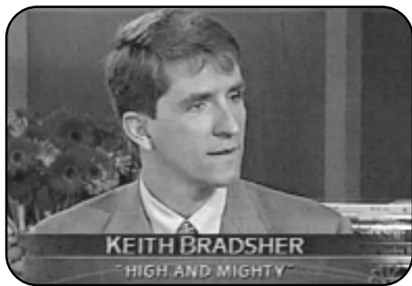
Today gave free rein to an author who claims SUV owners are “self-centered and self-absorbed” and not interested in their communities.