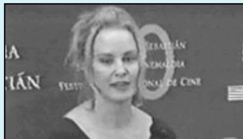
Jessica Lang criticized President Bush and the nation at a Spanish awards ceremony.

Asner also appeared on The O'Reilly Factor on September 26 and accused the President of "desecrating the country I grew