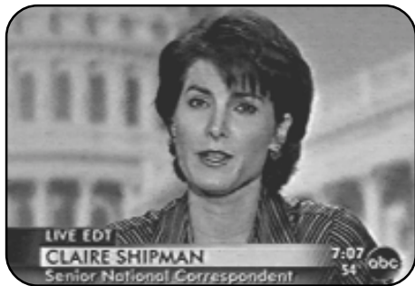
If Al Gore said it...it must be true.

"Remember, in 1991, Gore was one of the few Senate Democrats to vote for the Gulf War," she told Good Morning America viewers on September 24. "In fact, he noted proudly yesterday that he