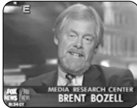
On Hannity & Colmes MRC President Bozell discussed the networks refusal to cover President Bush's October 7 speech on Iraq.

Invited on Fox News Channel's Hannity & Colmes on October 8 to discuss the issue, I made the point that on the